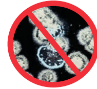
VOC's / Odors